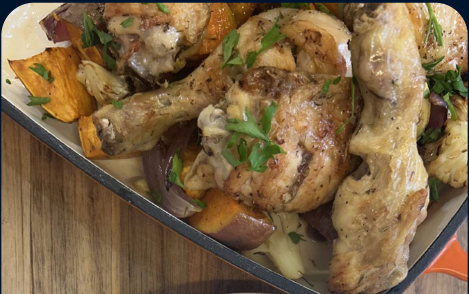
Plate the roasted chicken and vegetables, garnishing and serve!